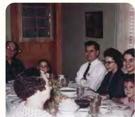
Good Old Days